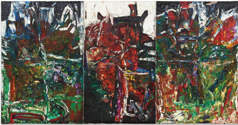
Jean Paul Riopelle's Les Picandeaux , 1967 (Acquavella Galleries)

Art shows you can't miss this week in New York. We pick only 3. Weekly post from ArtList, the online marketplace for private sales.